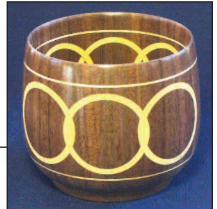
Walnut Segmented Bowl by Glen Bohusch