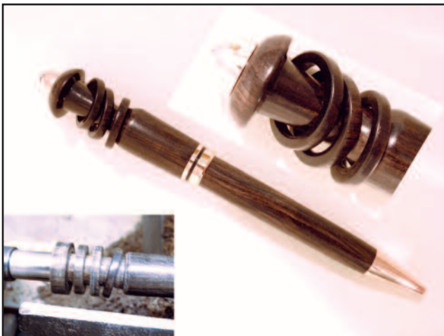
Triple Captive Ring Pen by Carl Knoll